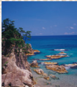
Sanin Kaigan Global Geopark